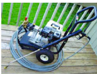
Power Shifter on a pressure washer.

The St. Louis Urea Center, which adds 63,000 tons of fertilizer storage to Lange-Stegmann's existing space, will increase product handling capacity up to 1 million tons annually of imported urea.